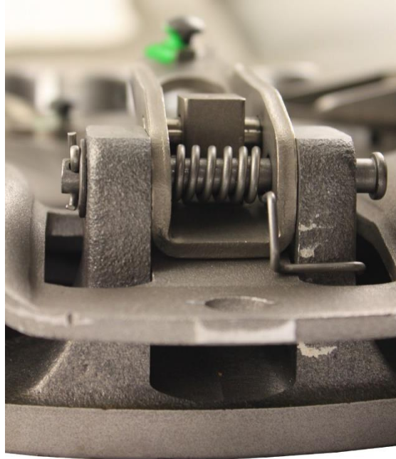
After Installation Nut is removed